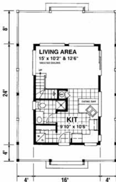
First Level 384 sq.ft. Plan No. 584